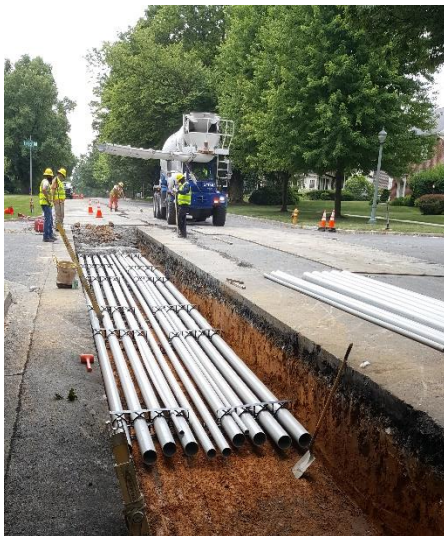
Left: Elm Avenue redesigned duct bank.

Here's a look at some of the recent work: